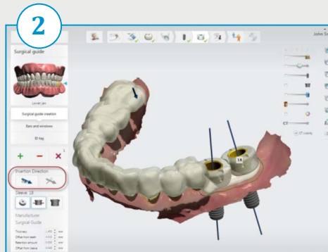
SURGICAL GUIDE FABRICATION