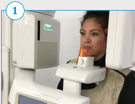
3D XRAY (CT)