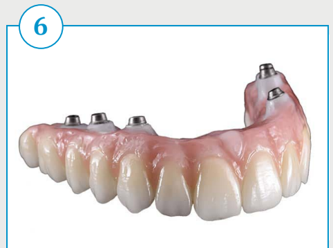
DELIVERY OF PERMANENT ZIRCONIA FIXED DENTURE